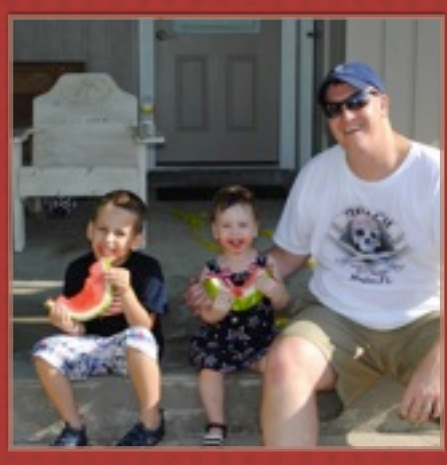
Fun with our niece and nephew! Nothing beats watermelon after a hot day of fishing on the coast!