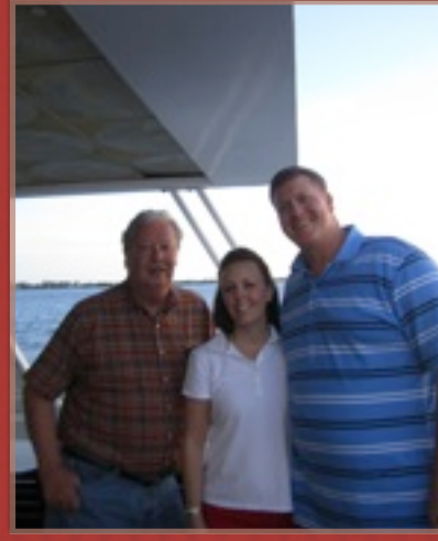
Sailing with Grandpa in the Gulf of Mexico near Florida!