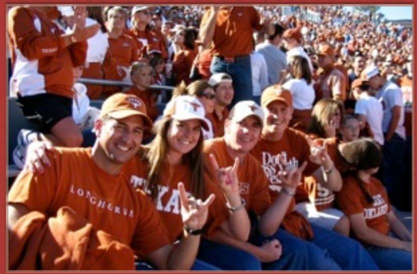
Football at The State Fair with family!